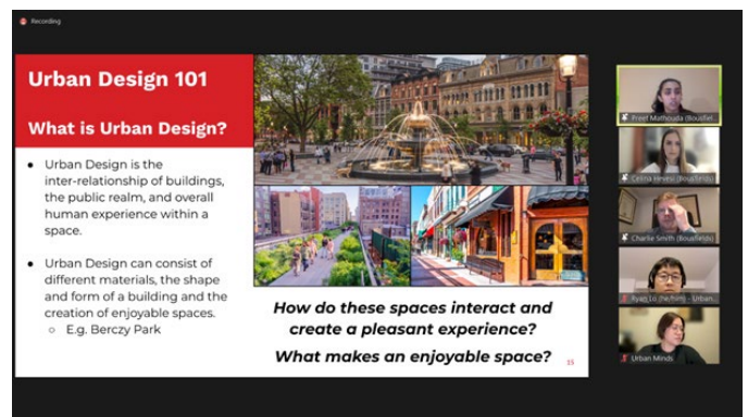
Our partners at Bousfields presented on urban planning and design during World Town Planning Day in November

1UP Webinars are a curated series of online workshops covering topics from practical software skills to postsecondary applications to trending city-building topics, giving students a deeper understanding of the industry before they pursue a related career or postsecondary education.