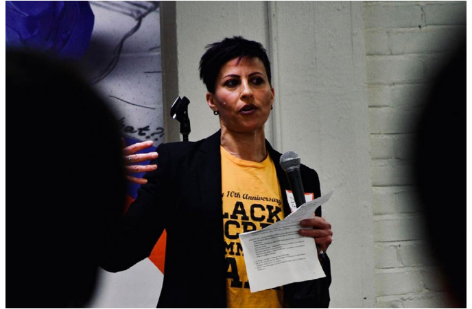
Guest speakers share their knowledge and experience with our participants