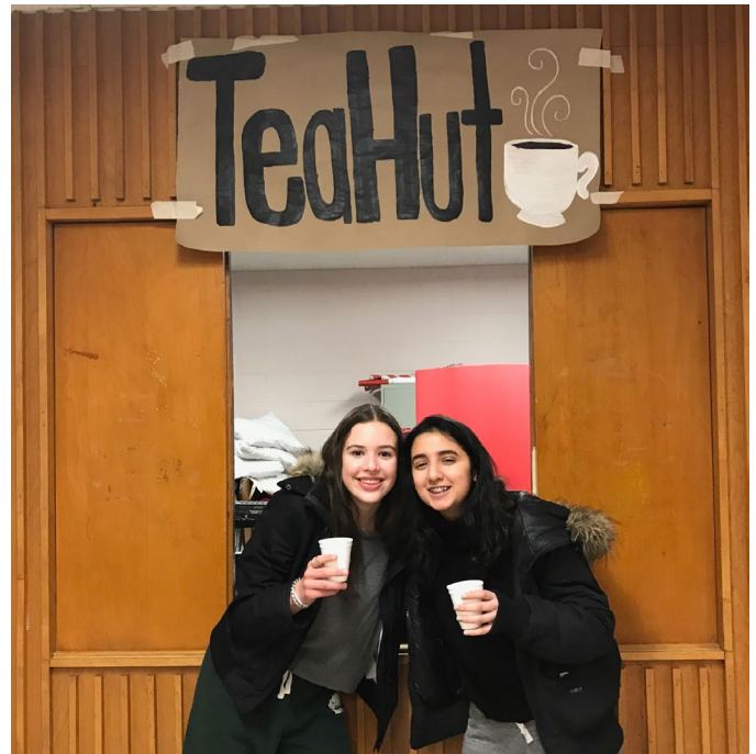
1UP York Mills successfully transformed a storage room at school into a student lounge to promote mental health