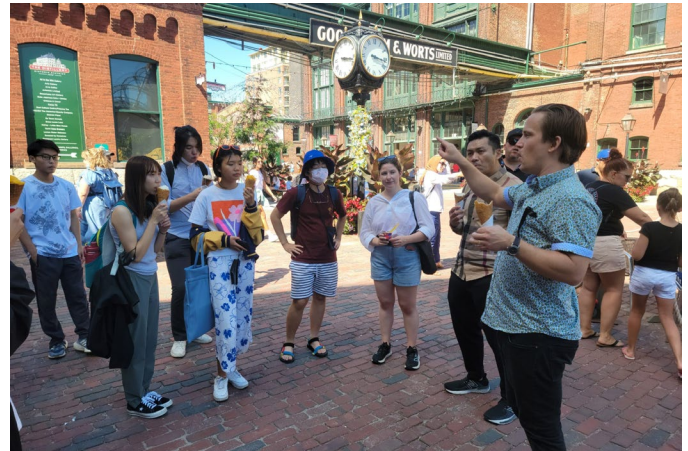
Our partners at SvN led participants around Distillery District as part of their Office Tour

We partner with urban planning, architecture, and engineering firms in Ontario to host 1UP Office Tours for high school students. Students have the opportunity to experience firsthand the day-to-day job environment while gaining career insights from working professionals.