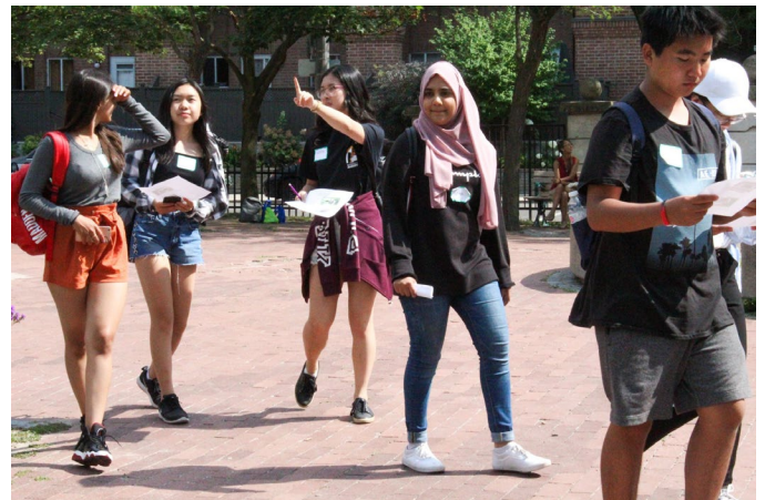
Our urban scavenger hunt helps the 1UP Fellows build their observation skills