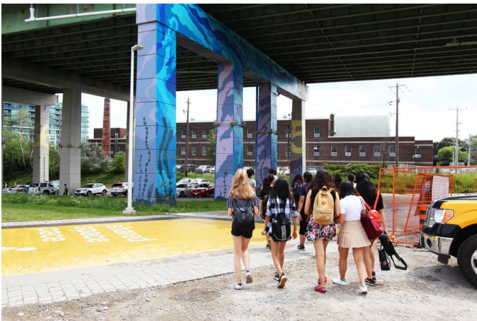
Guided walking tours of interesting urban spaces such as The Bentway in Toronto

Leaders Lab is a two-day orientation camp for new 1UP Fellows. The 1UP Fellows will go on guided walking tours to learn about city building and participate in interactive games and activities covering topics including fundamental urban planning and design principles, leadership and teamwork, project management, and public speaking.