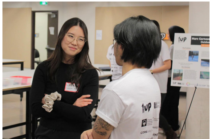
Students and volunteers meet and network throughout the event