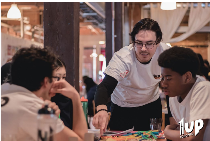
Volunteer facilitators help guide the student teams during the Design Jam