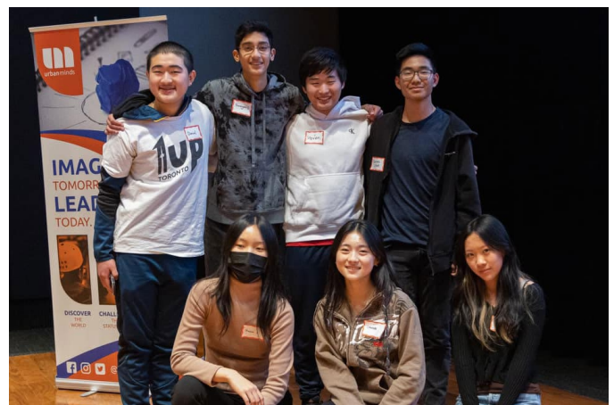
1UP White Oaks were the winners of the 2023 Design-Build Pitches for their proposal to create outdoor seating at school