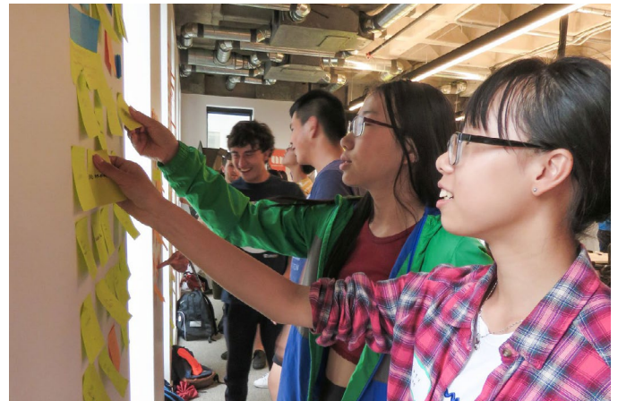
1UP Fellows work in teams to solve problems and generate solutions