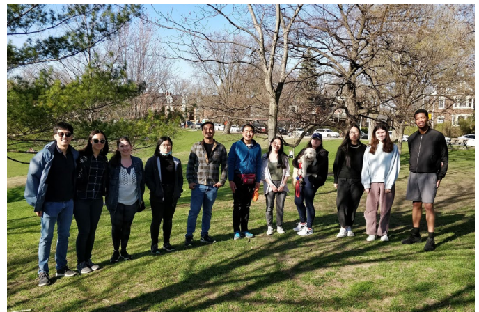
Team picnic at Riverdale Park in Toronto to celebrate the end of the 2022 program year

Our Program Coordinators in Toronto, Hamilton, and Kitchener-Waterloo will be organizing free local events for participants who want to learn more about their city and meet like-minded peers.