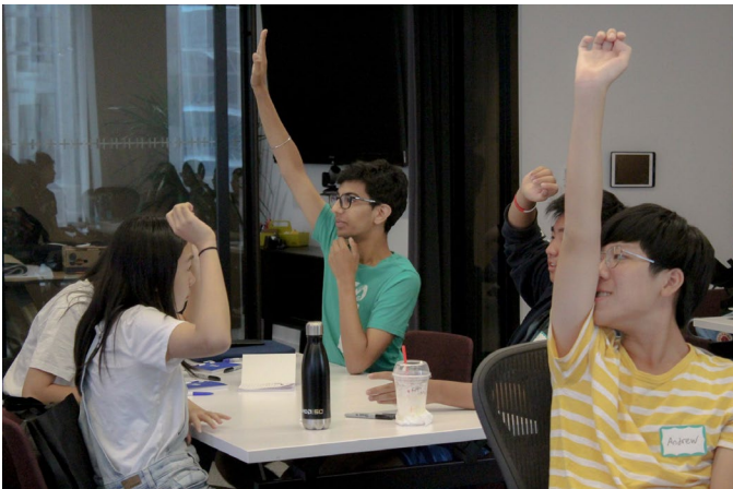
1UP Fellows participate in hands-on and engaging workshops